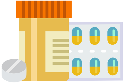
Expired and unused drugs

PHARMACEUTICAL WASTE WHICH DOES NOT INCLUDE CYTOTOXIC OR CYTOSTATIC DRUGS FOR INCINERATION ONLY