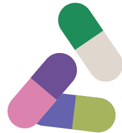
Denatured controlled drugs