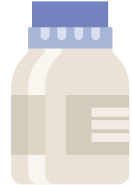
Vaccination Vials (not cytotoxic/cytostatic medicines)